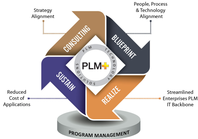
Figure 2—The Breadth of Geometric's PLM+ Offering

Their PLM consulting process uses a well-defined, value driven methodology. A variety of tools within the PLM+ framework support clients that are new to PLM technology as well as companies with mature PLM implementations. Experienced consultants and program managers work with clients to develop a key process indicator (KPI) baseline, PLM strategy roadmap, solution architecture, and implementation plan that can leverage technology from all the major solution providers for the full product lifecycle. A key part of the plan is the inclusion of KPIs based on Geometric's implementation experiences. The KPIs guide the implementation project and long-term operation of the PLM environment ensuring that planned value is realized.