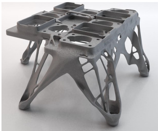
Figure 1—Satellite Bracket Generated using MSC Apex Generative Design is more Lightweight while Reducing the Overall Stress Level

To gain a competitive advantage, product designers seek to use the latest technology but do not want the burden of having to use highly skilled resources. Hexagon ( www.hexagon.com ), a global provider of information technologies that drive manufacturing productivity, acquired MSC Software in 2017 and developed the Apex Generative Design solution to deliver on that goal. 1 CIMdata defines generative design as a process wherein the shape and composition of a product are determined by using physics-based simulation and other analysis methods that consider performance requirements and optimize objectives such as minimum cost and weight.