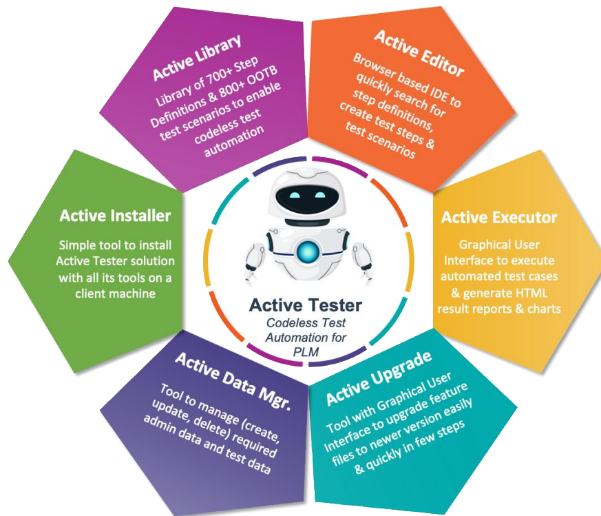
Figure 2—HCL's Test Automation Approach

The upcoming EngineeringCloud solution is significant as HCL owns all infrastructure, including the software licenses. When combined with the infrastructure, including cloud workstations, all available via the cloud in a pay-per-use model, a big shift in business operations can happen.