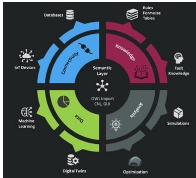
Figure 1—TCS PREMAP Architecture: Analysis and Data Connected to Knowledge Repositories

PREMAP’s heritage is in determining optimal engineered material products. Determining material properties often involves careful, costly experimentation to discover failure conditions. Using simulation, once correlated, to explore the performance boundaries of a refined material speeds up scientific discovery and understanding. Knowledge guidance plays a key role in making better decisions with higher confidence. Combining historical knowledge with simulations and the most recent laboratory measurements improve the context for materials engineering decisions.