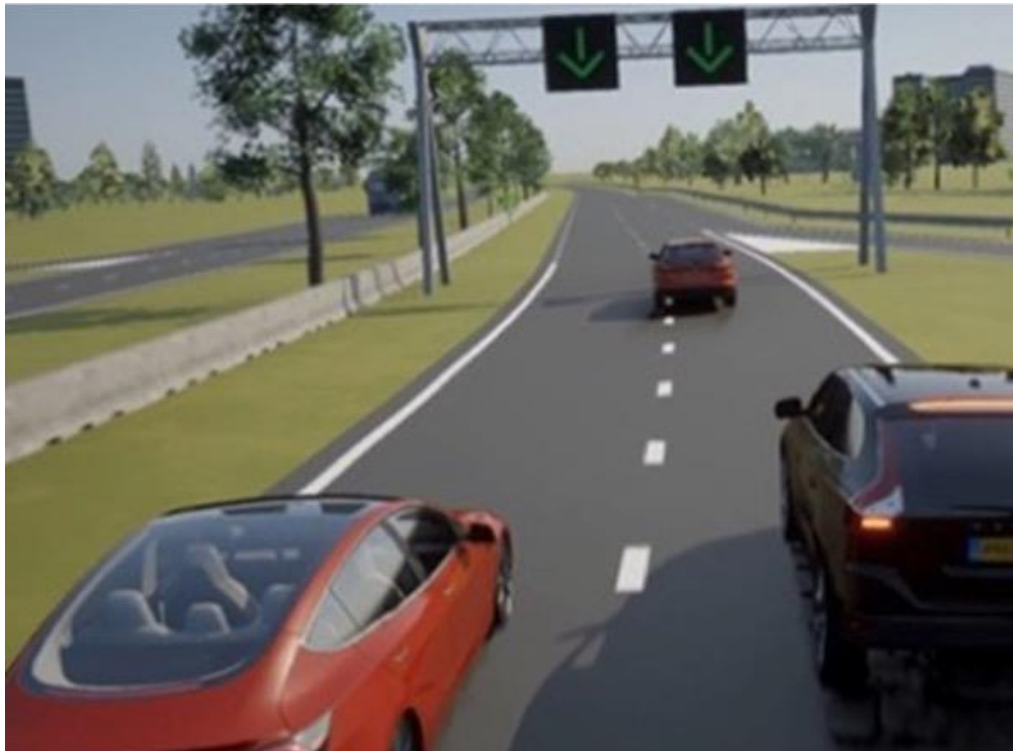
Figure 1—Many Possible Scenarios Occur when Vehicles Interact

Trusted models come from correlated product usage experiences. Models can be adjusted to reflect the latest usage measurements. More accurate models create an environment where new ideas can be assessed quickly. The replay of these experiences need scenarios—vehicle motion and sensing scripts. Critical scenarios improve optimization of a product's design and evolution while assuring companies meet applicable requirements, from performance to sustainability and any others the market demands. Reliable vehicle upgrades result from optimization methods using known scenarios. This includes scenarios that incorporate multiple vehicles and weather conditions. Robust products with reliable upgrades are the hallmark for great companies, keeping customer safety and satisfaction in the fore.