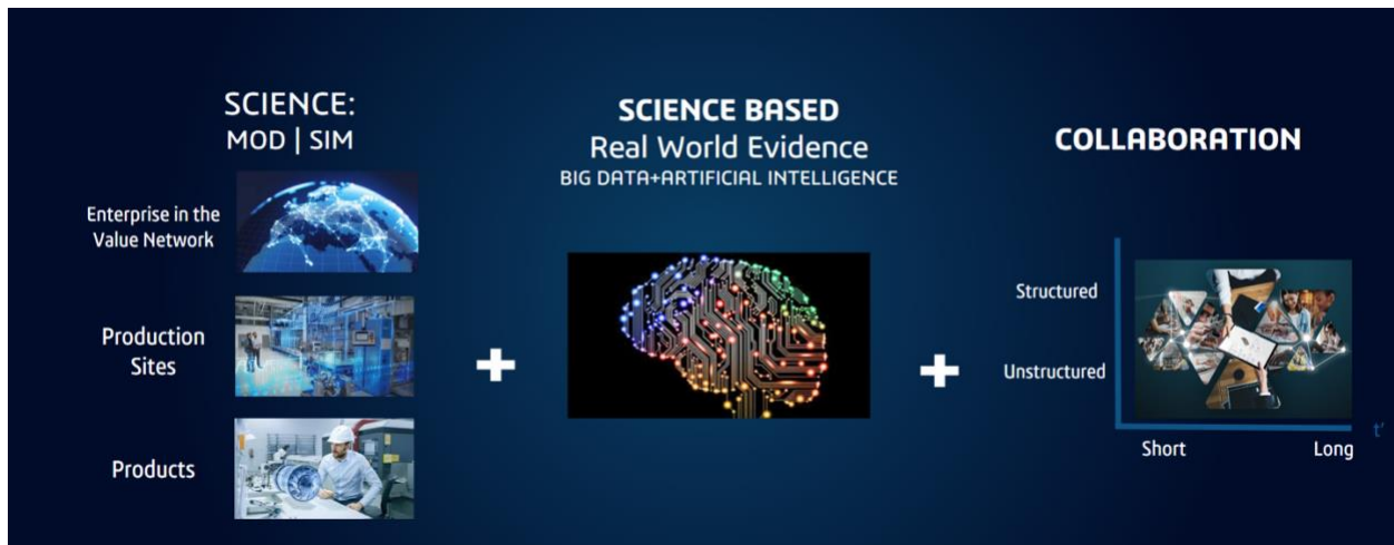
Figure 1—Virtual Twin Experiences: A Combination of Science, Real-World Evidence and Collaboration

Figure 1 shows the breadth and depth of the Dassault Systèmes vision to harmonize product, nature, and life with functional, logical, and physical models from broad-based mission engineering to molecular modeling to support drug and materials development. The company was the first to posit the importance of such modeling breadth and depth and, over time, has built out this vision using a combination of organic development, mergers and acquisitions, and strategic partnerships. Their strong focus on life sciences and nature is unique among their PLM competitors. Dassault Systèmes believes that they can bring the learnings from their strong position and experience in manufacturing to the life sciences. This approach has some value, particularly since their target industries lag their traditional manufacturing client base in digital technology adoption and deployment.