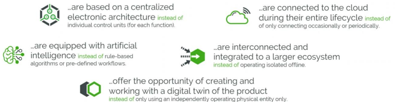
Figure 2—SDP Characteristics

PTC understands software defined product's (SDP) complexity. Mr. Luca de Meo, Renault's CEO, states that "SDP will become better and improve themselves day by day." There is a need to move beyond the original product data management (PDM) only systems to manage development and mass production. In this environment, the utilization and support phases of a product's life must also be managed, and in some cases may lead to new revenue opportunities as the latest applications provided on an SDP platform are utilized. Note the five key characteristics of SDPs are described in Figure 2.