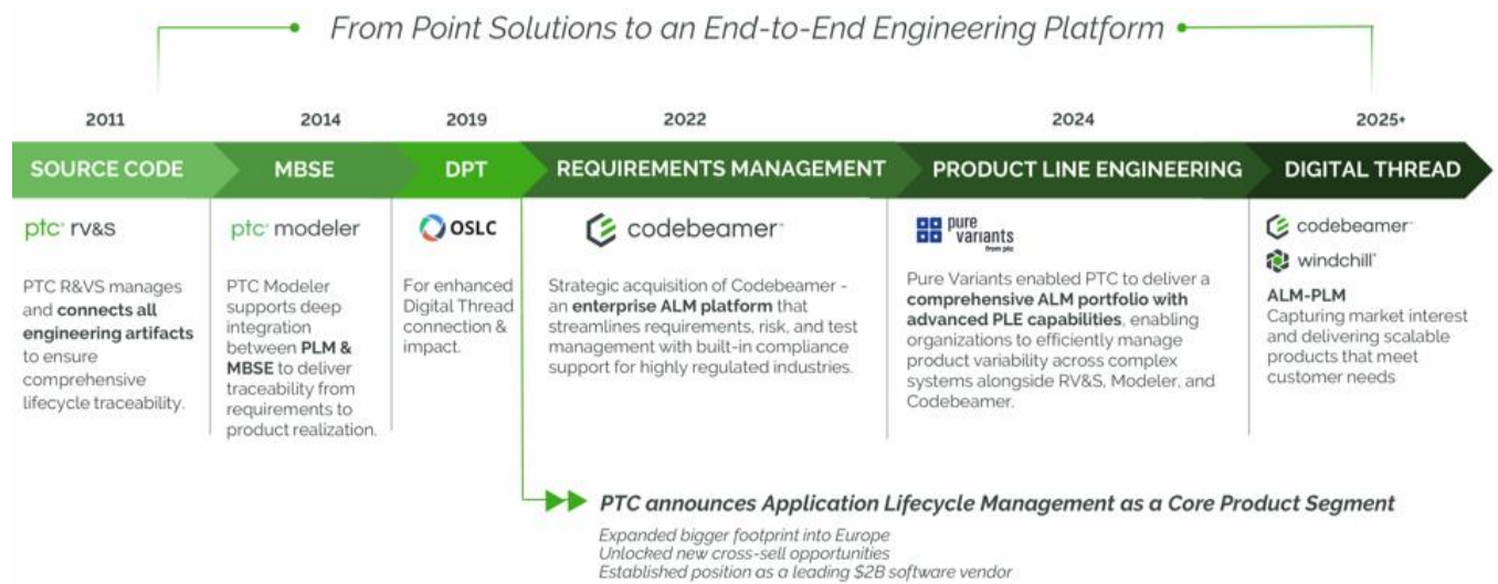
Figure 3—Acquiring and Combining ALM Capabilities

Competitive SDP complexity pressures require better decisions made faster to comply with regulations. Systems engineering driven with proven models, aka MBSE, is a skill today's engineers must embrace, regardless of their specific engineering expertise. These are required to ensure quality and sustainability across the SDP lifecycle. Modern PLM ecosystems (i.e., PTC's Windchill), are integrating ALM capabilities (i.e., PTC's Codebeamer 3.0, Modeler, and Pure Variants) across the complete product lifecycle, as CIMdata defines it. PTC states, "Codebeamer empowers companies to deliver innovative, safe & secure software-defined products faster and more reliably through mastering product complexities and variability with agile collaboration in the digital thread."