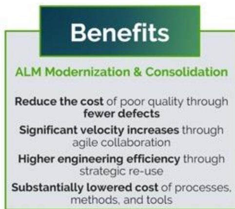
Figure 1—ALM Modernization & Consolidation

PTC is delivering its latest advances in ALM by introducing an AI capability that helps users improve their multi-contextual understandings of the current elements of design they are working on. It does not matter whether the elements are mechanical, electronic, or software. What matters is that all disciplines share the same customer requirements and regulations, especially as they change during the lifecycle. These often change during development and use, which in turn makes continuous requirements traceability essential. The systems engineering and orchestration required to bring today's products to market requires an environment which is agnostic to specific engineering disciplines while being comprehensive as the product is being made.