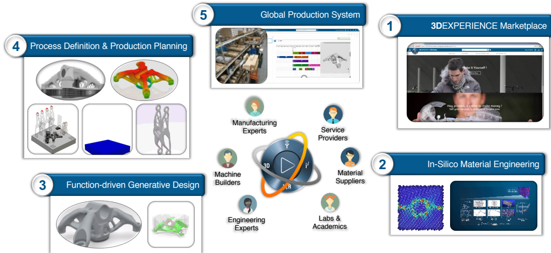
Figure 2—Digitally Connected 5-Step Process from Atoms to Parts

This 5-step strategy encompasses a holistic end-to-end approach that highlights the scope of Dassault Systèmes comprehensive Additive Manufacturing (AM) solution portfolio and encompasses material, geometry, process, and the environment in which the final part performs. Starting out, the 3DEXPERIENCE Marketplace is not only a procurement marketplace, but an entire ecosystem comprising AM manufacturing experts, AM machine builders, AM service providers (e.g. strategy, materials, manufacturing, labs, and academics).